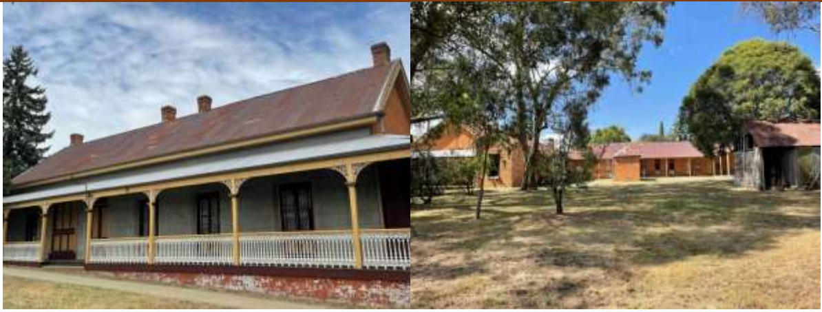
Figure 3: Porch of former London Tavern, Beechworth, VIC. (Photo © J. Staring, 2024). Figure 4: Yard and outbuildings of former London Tavern, Beechworth, VIC. (Photo © J. Staring, 2024).